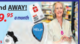
This Button SAVES Lives!